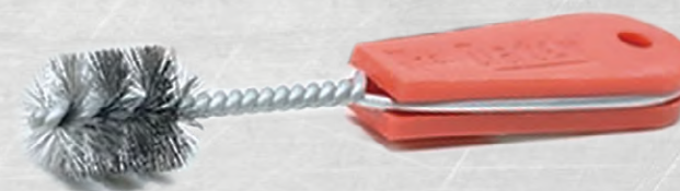
1" Pipe Brush