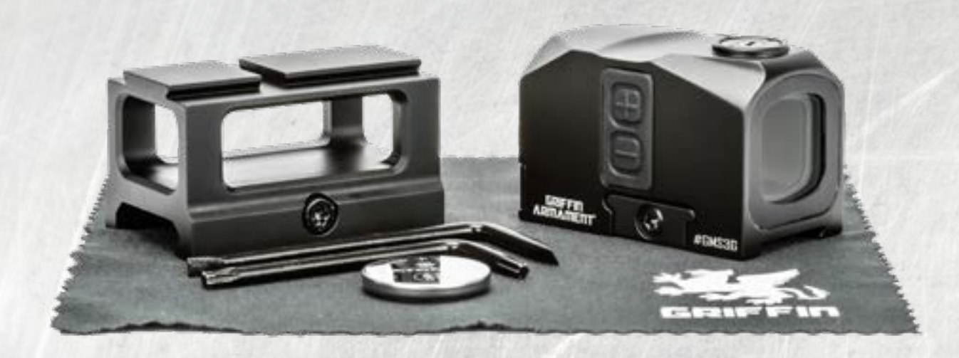
(1) Riser Plate, (2) Allen Keys (Flathead & T6 Torx),(1) CR2032 Battery, (1) Cleaning Wipe, (1) GMS™ Optic

Included with the GMS ^{\text{TM}} are all the tools necessary for installation and use right out of the box. The included riser mount can be installed to any picatinny rail setup using the included T6 torx allen key to loosen, then retighten the T6 bolt on the riser once installed to the rail. The GMS ^{\text{TM}} mounts to the included Acro footprint riser in the same fashion, using a T6 Torx clamp screw.